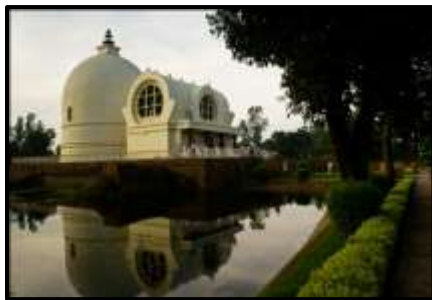
Maha Prinirvana Temple