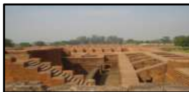
Remains of Old Nalanda