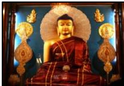
Bhumi Phassa Mudra