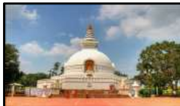
Vishwa Shanti Stupa