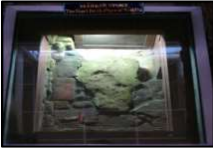
Maker Stone of His birth place