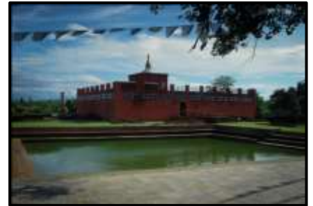
Maha Maya Devi Temple