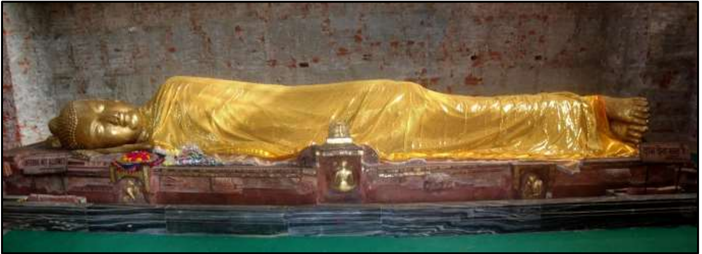
Lord Buddha in His release of breath for Maha Prinirvana