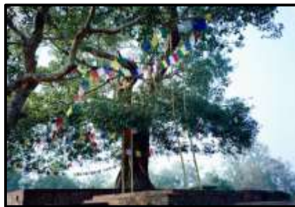
Ananda Bodhi Tree