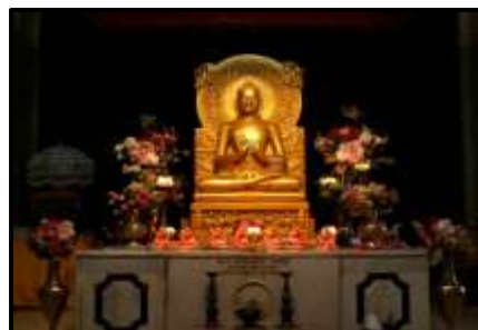
Buddha Statue by Sri Lamka