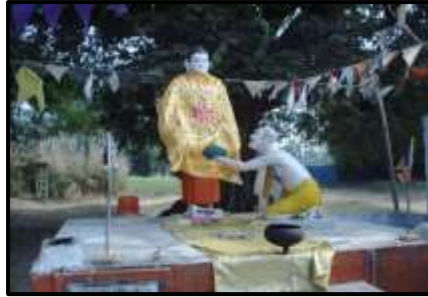
Kusha Grass Temple