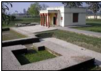
Matha Kuar Temple