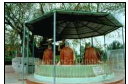
Buddha Statue by Myanmar