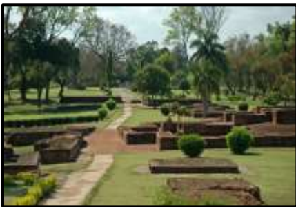
Jetavana Vihara Garden