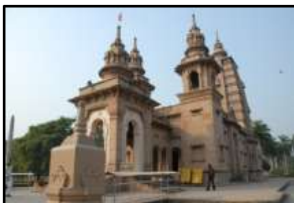
Mul Gandha Kuti Temple