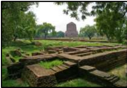
Excavated Remains of Sarnath