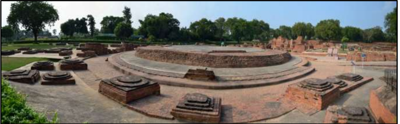
Dhamma Rajika Stupa where Lord Buddha delivered His First Sermon ( Dhamma Chakka Pavattana Sutta )