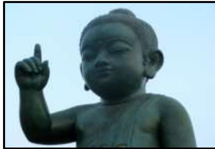
Baby Buddha Statue