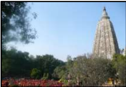
Maha Bodhi Temple