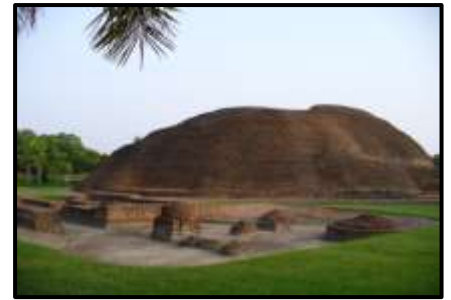
Makuta Bhandha Stupa